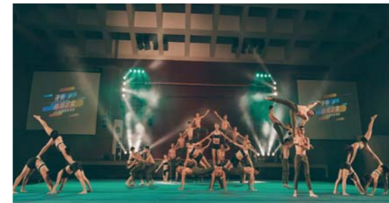
The Sports Show of Class 2019, Department of Physical Education in National Taiwan Normal University.